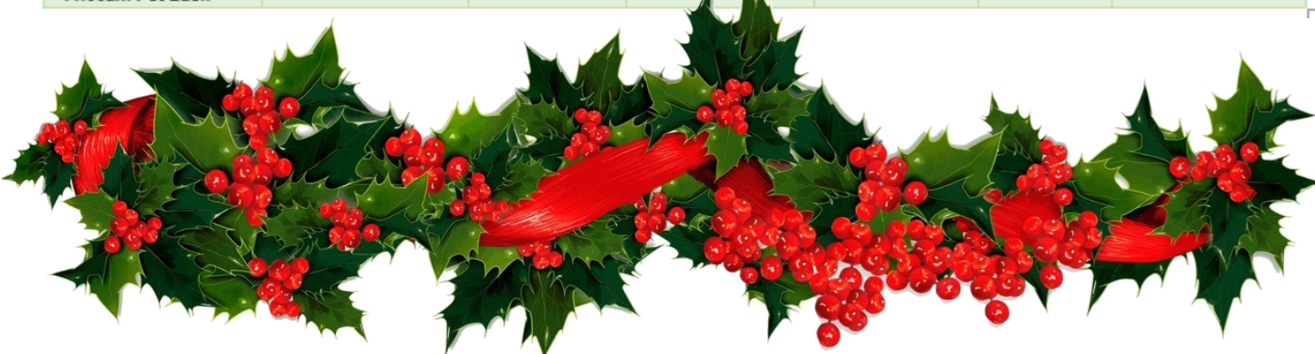
Praying you have a blessed Christmas and New Year